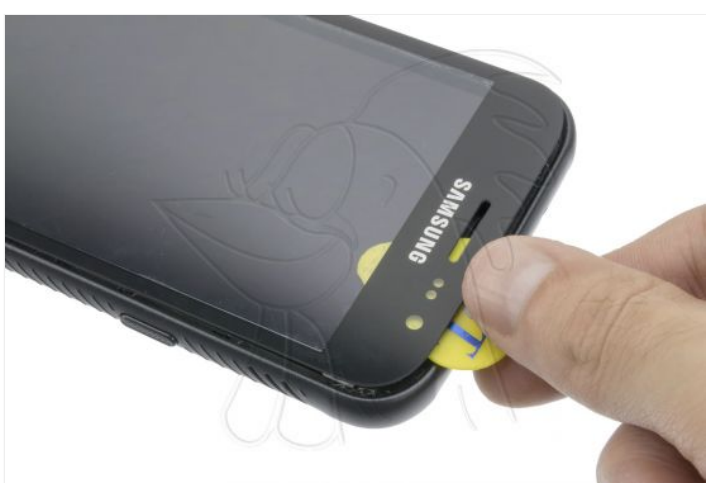
Step 3 - Separate screen

With a card or a very flexible and fine tool, we will take off the display introducing this one below, very carefully so that it does not scratch.