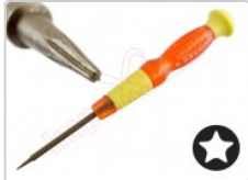
Pentalobe screwdriver 0.8 for iPhone devices

For this tutorial you will need the following spared parts and tools that you cant get at our online store Impextrom.com Click on a tool for visit the website.