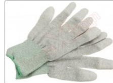
Touch ESD glove, for antistatic protection, size M