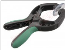
Suction cup to separate screens in general