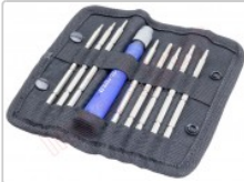
Screwdriver with 8 heads Peng Fa 7339A