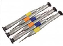
Set of 6 screwdriver BK-3335A