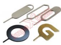
SIM card removal tool for all brands