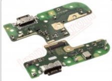
PREMIUM Suplicity plate with components for Motorola Moto G9

For this tutorial you will need the following spared parts and tools that you cant get at our online store Impextrom.com Click on a tool for visit the website.