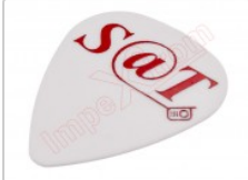
Special SAT 0.6mm PET pick, high friction and high resistance