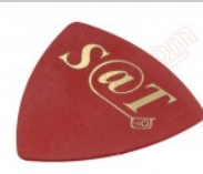
Special SAT 0.75mm high friction PVC pick