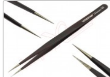
ESD-12 precision antistatic tweezers with fine tip