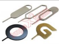
SIM card removal tool for all brands