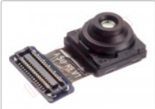
Front camera 25Mpx for Samsung Galaxy A40, SM-A405FN-DS / Samsung Galaxy

For this tutorial you will need the following spared parts and tools that you cant get at our online store Impextrom.com Click on a tool for visit the website.