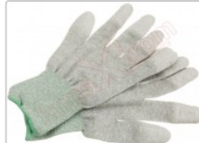
Touch ESD glove, for antistatic protection, size M