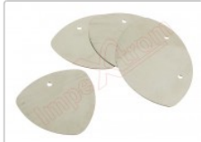
Set of 5 metal picks for opening

For this tutorial you will need the following spared parts and tools that you cant get at our online store Impextrom.com Click on a tool for visit the website.