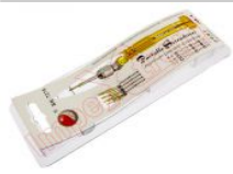
BK-7275 (A Version) 5 in 1 screwdriver