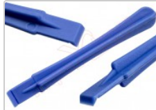
Terminal opening tool, plastic