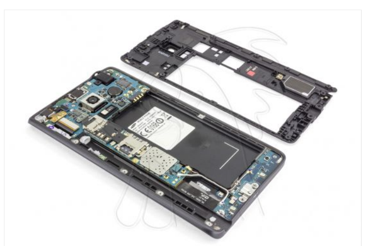
Step 6 - Disconnect components

To get to the handset, we will have to remove the motherboard beforehand. For this we will disconnect the components that, in turn, make it subject to this.