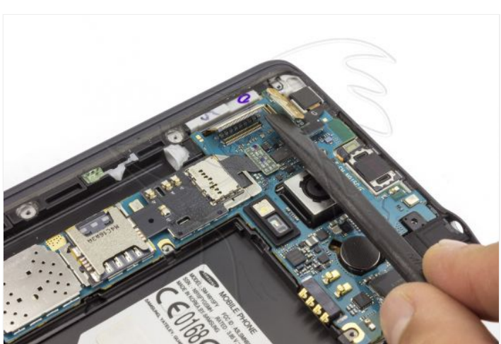
Step 7 - Disconnect components

We continue disconnecting the components of the motherboard. Now we disconnect the antenna coaxial cables and the flex of the start button. To remove the plate, with the help of an opening tool, we will leverage the part shown in the images to disconnect it from the lower plate.