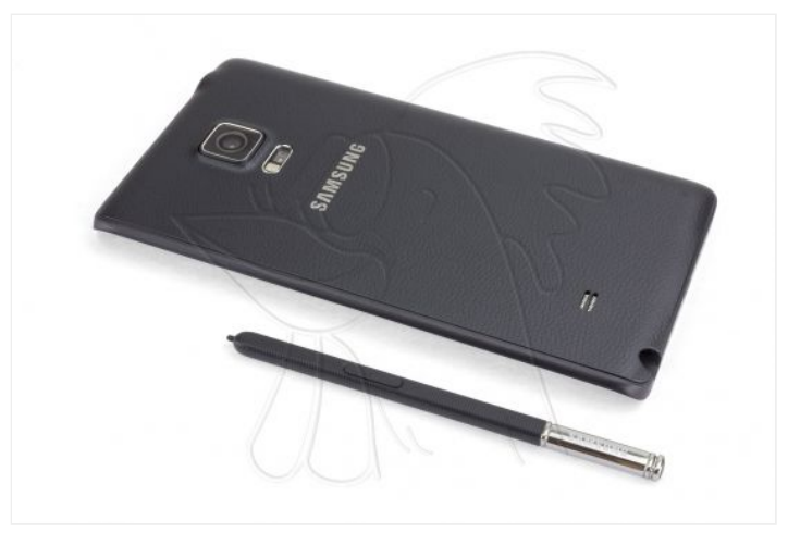
Step 3 - Remove back casing

Using a plastic opening tool, we will disengage the housing from the notches that hold it.