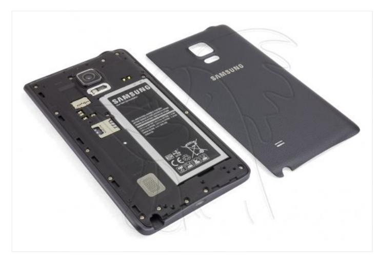
Step 4 - Remove battery

With the opening tool we will lever the bottom of the battery to disengage it and thus be able to remove it.