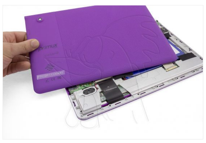
Step 4 - Volume keys

Finally, remove the volume keys with tweezers.